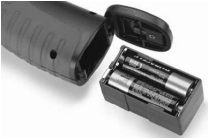
Figure 4 – Battery Compartment