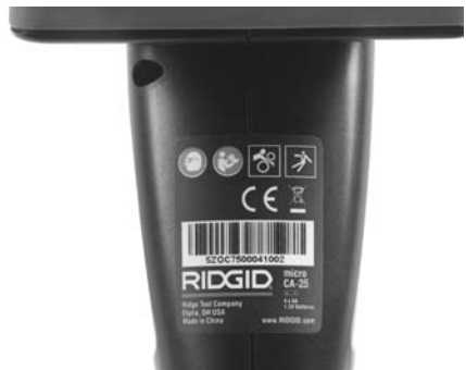
Figure 6 – Warning Label