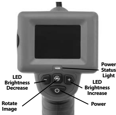
Figure 7 – Controls