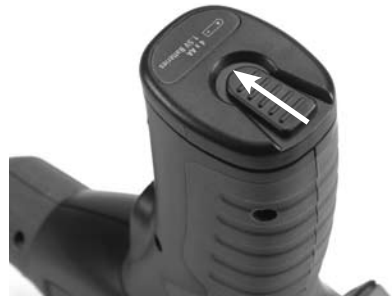
Figure 3 – Battery Door