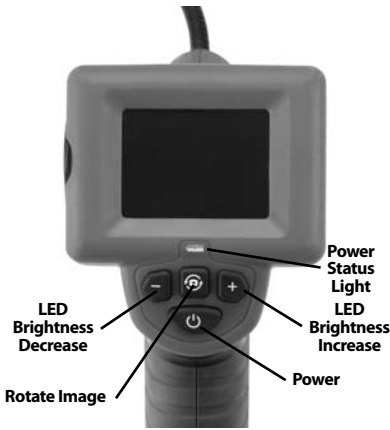
Figure 2 - Controls