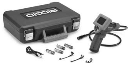
Figure 1 - micro CA-25