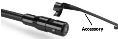
Figure 5 – Installing Accessories

To connect, hold the imager head as shown in Figure 5. Slip the semicircle end of the accessory over the flats of the imager head as shown in Figure 5. Then rotate the accessory a 1/4 turn so the long arm of the accessory is extending out as shown.