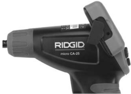
Figure 8 – TV-OUT Jack

Insert the other end into the Video In jack on the television or monitor. The television or monitor may need to be set to the proper input to allow viewing.