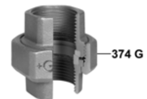
Black, BSPP Female