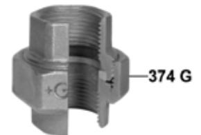
Black, BSPP Female